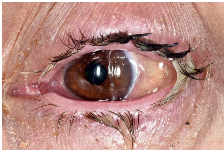
Conjunctivitis that produces sticky pus is contagious.