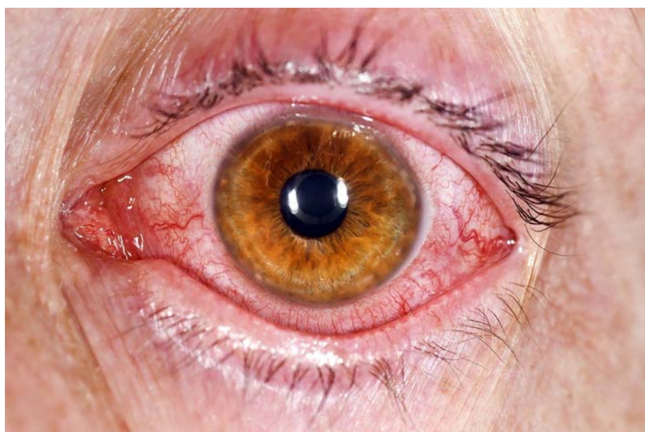
If eyes are red and feel gritty, the conjunctivitis is also usually contagious.