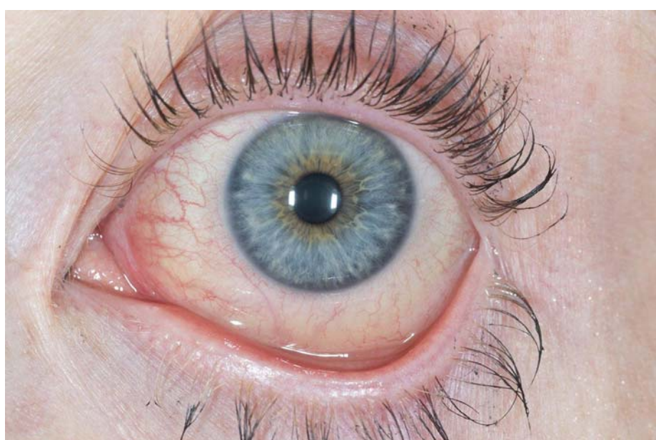
Conjunctivitis caused by allergies like hay fever makes eyes red and watery but is not contagious.